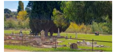
Participants in the Cemetery Scavenger Hunt.

Organising this many events required a lot of work from many of our members and we thank them all for their contributions.